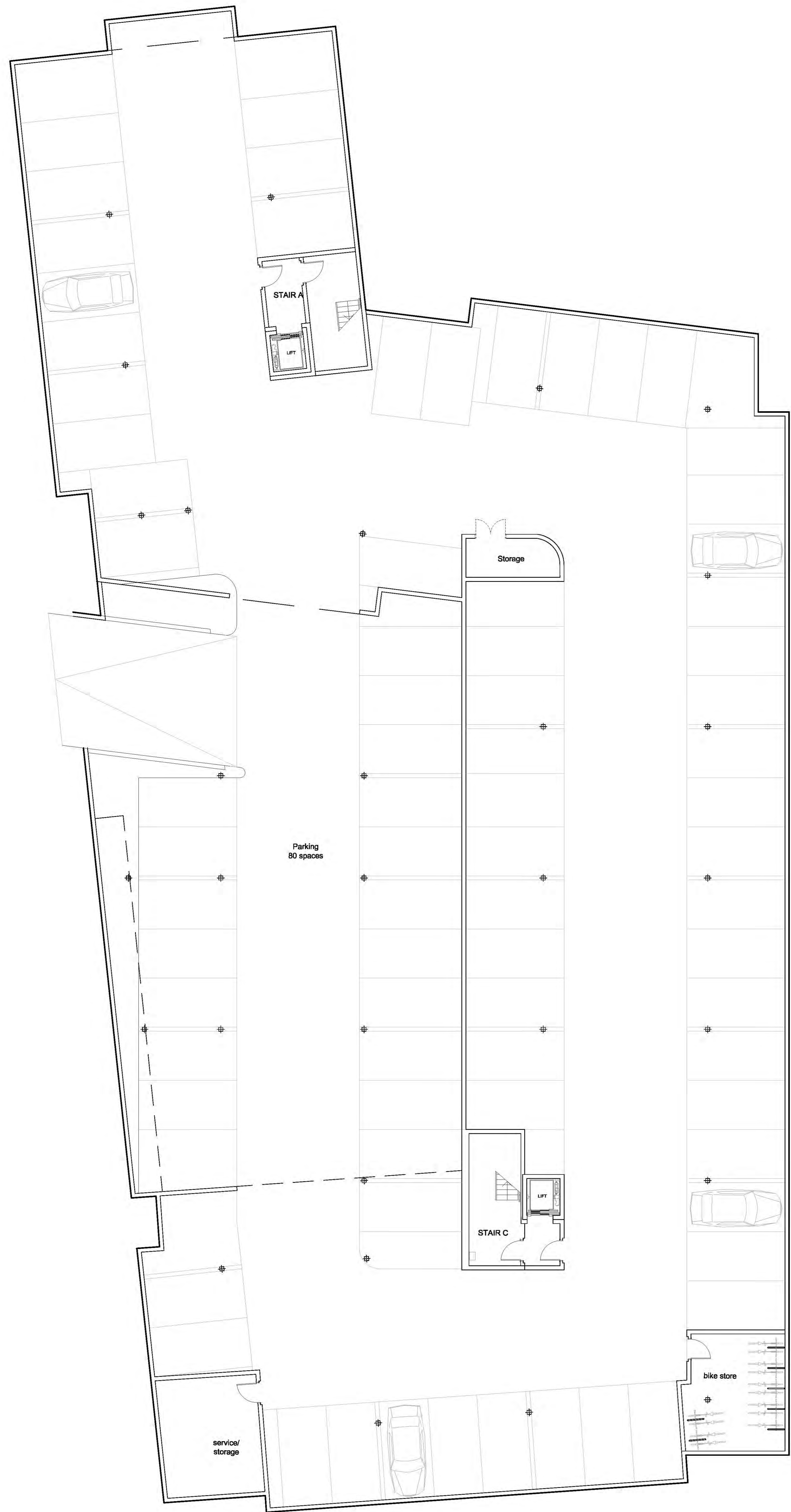
Basement Floor Plan